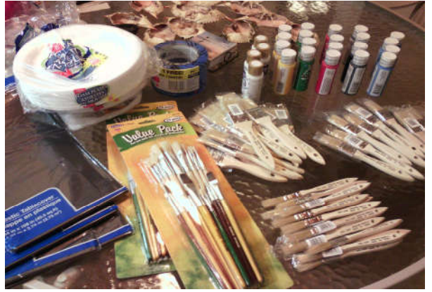
Paint supplies. Do not use thin acrylic craft paint

Use the <u>correct brush</u>! Like primers, paints and screens, not all brushes are equal. Some brushes are too stiff and others are too soft, even of the same brand. DO NOT USE SOFT CAMEL HAIR BRUSHES. Find a somewhat stiff paint brush that's appropriately sized for your canvas area you are covering. Start with big 2" and 3" brushes for large background areas and work your way down to smaller brushes for smaller subject matter and details. It may take some practice and experimenting to find a brush that's right for you. A softer brush can work well on softer cloth-like screen material whereas a stiffer brush can work better on a thick vintage metal screen.